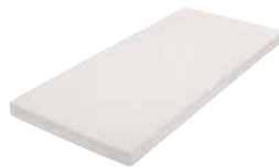
MA10 | MA15

rimellas made of elastic ash wood 7-fold spring suspension on natural latex strips in 2 levels