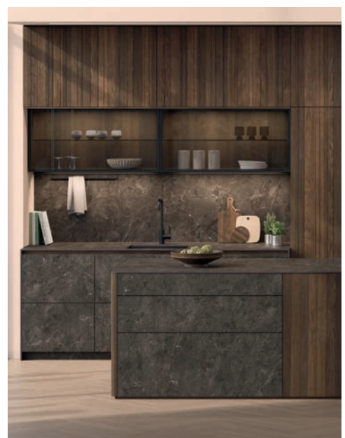
nya kitchen in smoked oak with MDi surface in umbra marrón

As the next generation in ceramic, MDi (Minerals, Design, innovation) by Inalco is noted for its aesthetic, environmentally friendly and resistant qualities. Using an innovative production technology, minerals of the highest purity are carefully selected to create a material with an incredibly precise texture and consistent colouring throughout. The surfaces are also highly resistant to heat, scratches and stains.