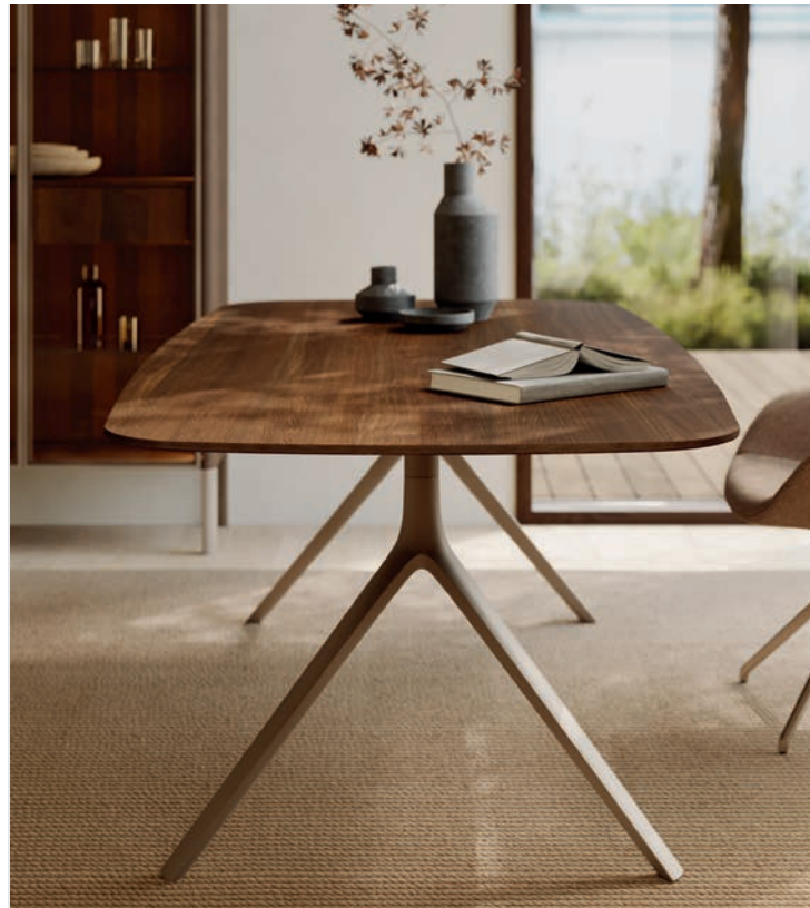
nya chair with clay metal frame and Glory hazel fabric, as well as nya table in smoked oak with clay metal frame