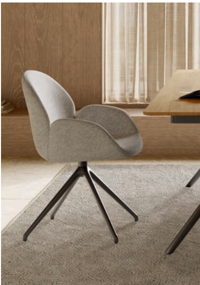
nya chair with Glory beige fabric