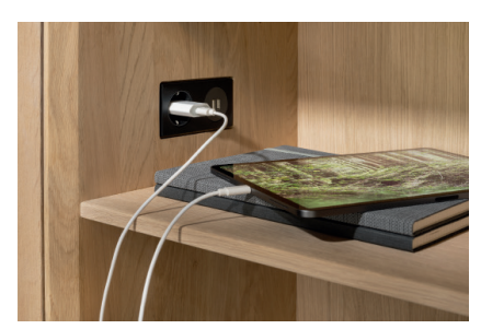
Details: cubus pure sideboard with pull-out drawer and power connection