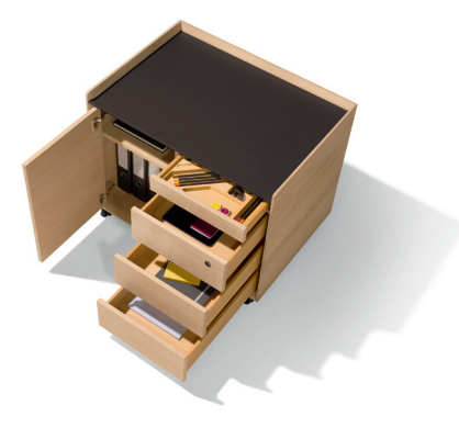
Office supplies practically stowed