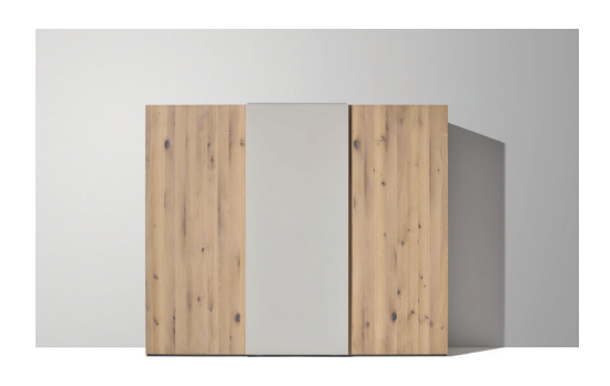
soft floating door wardrobe with new glass colour light grey