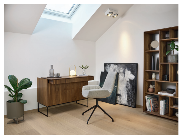
filigno bureau and lui plus chair with swivel base