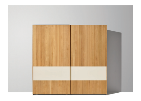
valore floating door wardrobe

TEAM 7 presents another highlight with its new fitting technology. For example, the central floating door of a 3-door design option can be moved to the left and right. This ingenious construction does justice to the living material wood and also guarantees the precision of the soft-closing mechanism. A further advantage to the new fitting technology is the simplified installation and easy adjustment of the sliding system, which in some cases can even be achieved without tools. This means that the space-saving sliding door wardrobes can also look attractive outside the bedroom and offer an impressive alternative to the hinged door in the entry hall, as well as in narrow room situations.