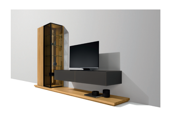
cubus pure wall unit with new glass colour graphite grey