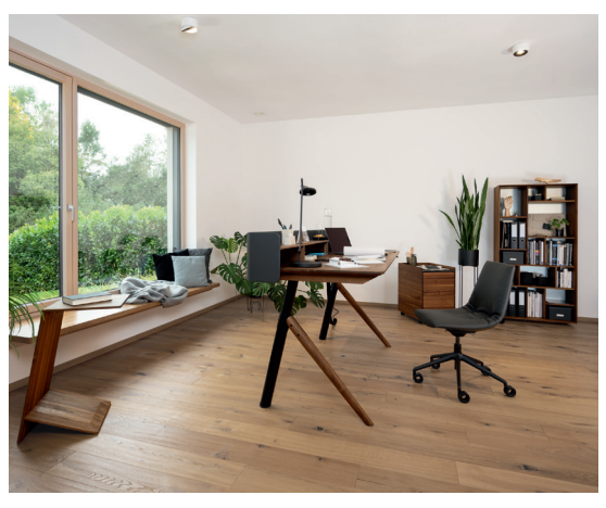
pisa desk and lui office chair

When carefully considered design and innovative technology meet cosiness and pure solid wood, the result is a modern living space: the wohn office<sup>T7</sup>. This concept by TEAM 7 is redefining the connection between living, nature and working, going beyond the simple design of a home office area. wohn office<sup>T7</sup> puts people and their health in the spotlight. The technical and ergonomic requirements are determined by the duration and type of work. The enormous range of products offered by TEAM 7 creates unique possibilities for holistic designs. Home working is increasingly taking over private spaces, calling for intelligent design solutions. TEAM 7 is rising to this challenge, with adept interior concepts for professional home working. Concepts that captivate with their cosy feel, sophisticated functions and superior craftsmanship, and adapt flexibly to individual needs.