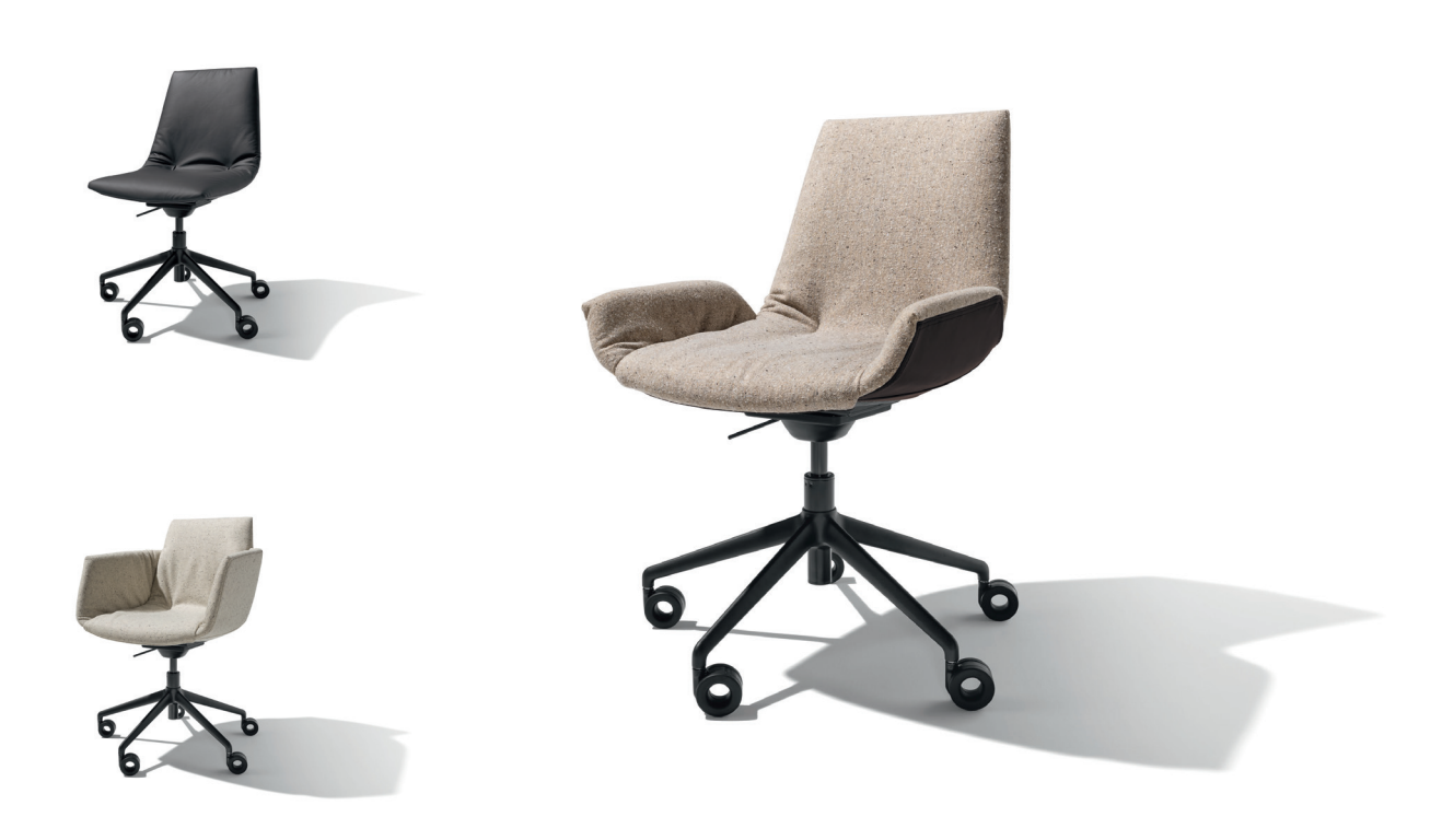
lui, lui plus and grand lui office swivel chair