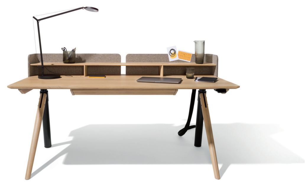
pisa desk with top unit and drawer