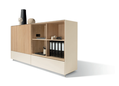
cubus pure sideboard with new glass colour natural white

TEAM 7 has expanded its multifaceted repertoire with the nuanced additions of a new leather colour and three new glass colours. By combining the various wood types in different ways neutral, understated and yet delightfully appealing colour combinations can be created – allowing new scope for your personal style preferences. This means that any of your favourite colourful vases can blend in well with the colour scheme. The new glass colours light grey and graphite grey exude a cool elegance and, like the soft natural white, combine elegantly with the attractive warmth of the wood. Light grey is the new addition to the range of leather colours L1 and enhances the elegant character of our furniture designs.