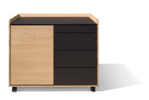
Leather cover on demand

"Professional storage space for the office or home office packed in a simple and elegant cover made of pure solid wood and leather." Designer Kai Stania