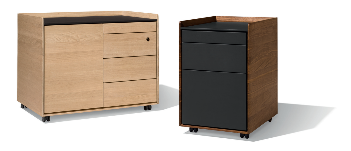
pisa desk pedestal in two sizes