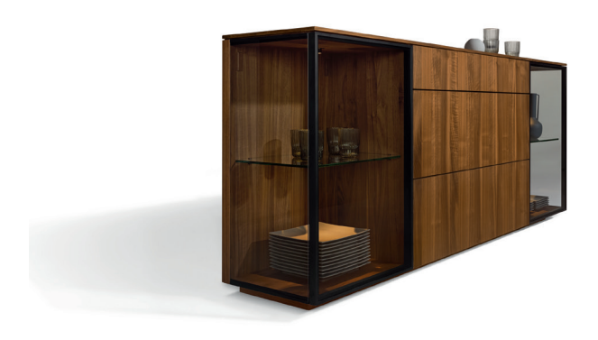
filigno sideboard 21 with aluminium frame

The filigno sideboard 21 with aluminium frame front looks equally impressive. The corner glass elements in clear glass or smoked glass are illuminated with movable black spotlights and thus subtly set the stage for your accessories. When mixed with closed drawer fronts, this creates a very unique piece of furniture for all occasions. There is also room for an optional drawer insert. The new filigno sideboard can be planned in two widths, two depths and in all TEAM 7 wood types.