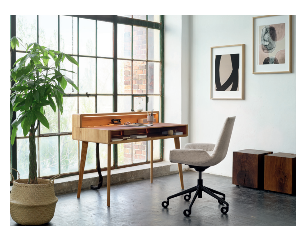
sol writing desk and lui plus office chair

With its wohn office<sup>T7</sup>, TEAM 7 has created everything that's needed to set up functional and yet attractively designed home office areas. From their size and materials to their inner workings, the pieces of furniture and system solutions are custom-made to individual wishes. All of the concepts are designed in great detail, sustainably manufactured and lovingly crafted from the finest natural materials. The different types of fine wood, finished exclusively with natural oil, promote a pleasant atmosphere and create a positive environment for people, helping them to keep a clear head. wohn office<sup>T7</sup> encourages efficient working not only through the sophisticated design of the furniture, but also through the beneficial effects of solid wood.