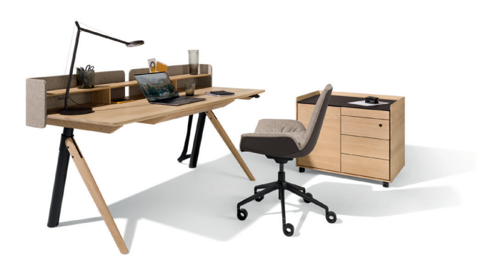
pisa desk, pisa desk pedestal and lui plus office swivel chair

It is this combination of craftsmanship and ultramodern technology that gives the furniture its soul. The interplay between lovingly hand-crafted details and precise high-tech manufacture opens up new dimensions in design and also balances the character of the striking solid wood with the high demands on intelligent functionality. This is because integrating the patented features perfectly into the design while also doing justice to the material calls for great skill in craftsmanship. From soft-close table extensions and floating doors through to height-adjustable kitchen islands, coffee tables and desks, a team of developers boasting a wealth of expertise with wood is always working on thinking up innovations and putting them into practice.