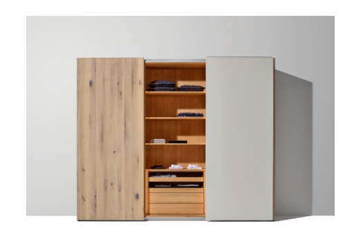
soft floating door wardrobe