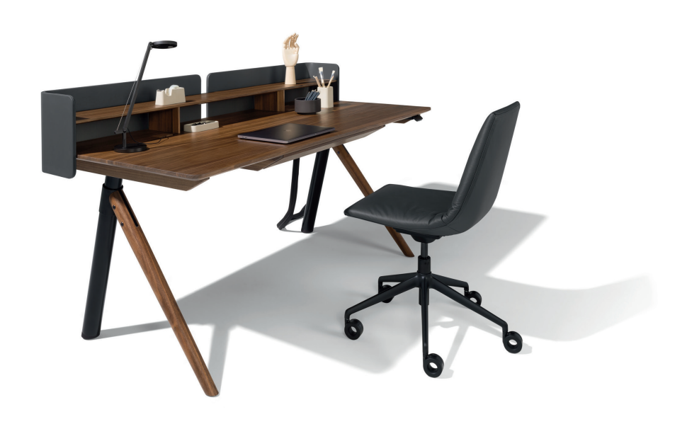
pisa desk and lui office swivel chair

Materials: moulded wood seat shell, foam cushioning, die-cast swivel base, wide range of fabric and leather covers