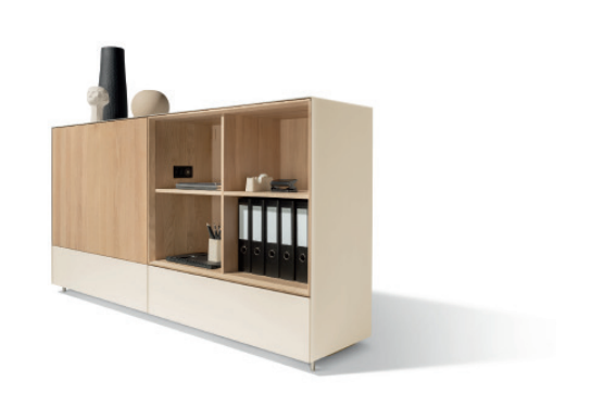
cubus pure sideboard with flush-fitted sliding door and elements of coloured