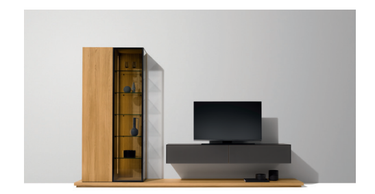
New design options for cubus and cubus pure wall units

Combined with a 39 mm thick panel, it is now possible to create impressive designs where the top board extends beyond the element. The necessary fittings for the wall mounting are both sophisticated and hidden in the solid wood panels. An optional integrated cable outlet in the top board, with a cable channel below it, makes wiring your home entertainment equipment intuitively easy – even when the top board is projected without an element underneath. Another plus: flush-mounted wooden panels pick up on the new material thickness and cut an excellent figure as a base. With a height of 16 cm, they lift the element off the floor and give it a visual impression of lightness. The new dot knob handle with end-grained wood front also wins points as a charming eye-catcher. It breaks up the cubic stylistic elements and creates soft accents with a lively character.