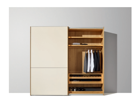
lunetto floating door wardrobe