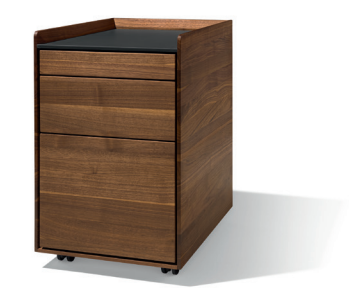
Flexible use due to castors