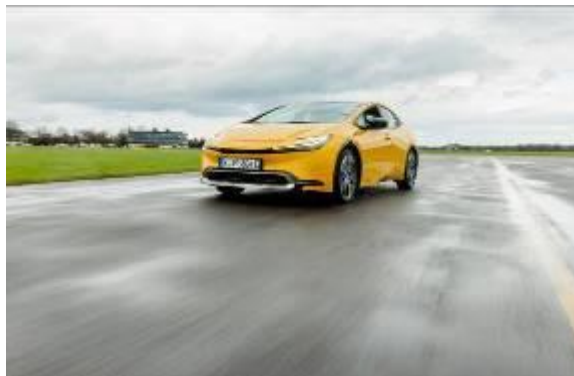
After thorough evaluation by the Red Dot jury, the Prius received the highest award, the Red Dot: Best of the Best