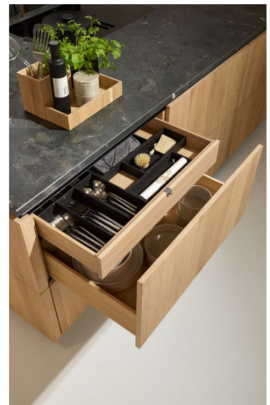
pur kitchen with clear kitchen architecture and recessed handles for easy handling.