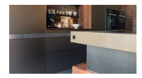
height-adjustable kitchen island

This and other press releases and photos are available to download at www.team7.at