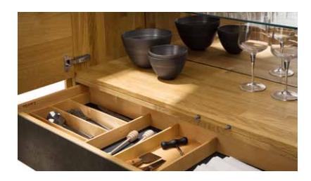
close-up filigno highboard

This and other press releases and photos are available to download at www.team7.at