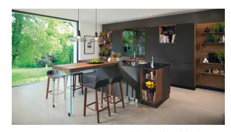
black line kitchen

Solid wood, glass and metal are harmoniously joined together in the linee "Black Line" to create a modern sense of comfortable living that is flexible enough to meet individual tastes thanks to the variety of items and diversity of arrangements – whether in the form of a classic kitchenette or with a kitchen island where the family cooks and spends time together.