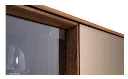
close-up of the filigno sideboard, highlighting TEAM 7's expertise with solid wood (fine construction and shadow gap)

This and other press releases and photos are available to download at www.team7.at