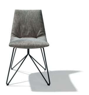
lui chair with Maple fabric and matt black frame

TEAM 7 introduced the metal colour matt black last year. Metal with a matt black finish is perfectly suited to an industrial chic style, and also to many other types of modern interior design. Initially the swivel base of the lui chair was introduced in the matt black colour. Due to the great popularity of the trend colour, TEAM 7 is now expanding its range of furniture with metal elements in matt black. The new wire frame for the lui and grand lui chairs is offered in matt black, as is the frame of the magnum or f1 chair and the slim legs of the tak table. In the kitchen, matt black handles are now available. The trend colour is also celebrated in the living room: with the base plate of the lift coffee table and TV column in matt black.