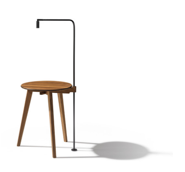
hi! side table with LED lamp

The round hi! side table weighs only 2.3 kilos and cuts a fine figure wherever it is needed – in the living room, entry hall, or bedroom. Three solid wood legs joined with cross-lap and mortice-and-tenon joints ensure great stability and robustness. One of the legs is extended upwards beyond the table. This design feature is what makes hi! really multi-talented: Here you can have a leather loop as a handle for easy manoeuvring, a hook support for the beautifully crafted TEAM 7 shoehorn, made in matching wood, or as a real hi!-light, an LED lamp which can be swivelled around, turned sideways or slanted downwards. This table is certainly versatile. As an alternative to the solid wood version – surrounded by a leather strip which serves both as a design feature and as protection for the edge – the table top is also available in clear glass. This enhances the lightness of the table's design, and allows the solid wood craftsmanship of the base to be clearly seen.