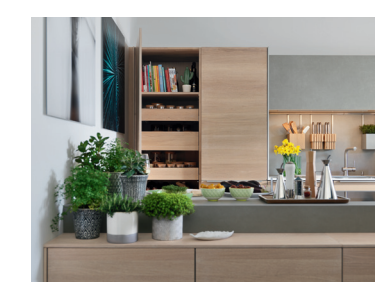
a natural treat for the senses

Kitchens today are no longer hidden behind closed doors, but open, welcoming and, above all, flexible. The floor plans of modern apartments give these layouts ample space. In keeping with this trend, TEAM 7 has designed the combined filigno kitchen and occasional furniture line in collaboration with the design firm Tesseraux + Partner. More furnishings rather than kitchen, natural materials such as wood and ceramic arouse one's appetite for this new form of cosy living. It can be used as a sideboard, work surface or functional kitchen island – in all cases, the clear design language of the system guarantees a consistent flow from the kitchen into the living area. And it is thoroughly sophisticated: the front part of the island serves as a sideboard, while the attached work surface made of ceramic turns it into a functional cooking island. Light, delicate and with an elegant emphasis on wood. The filigno occasional furniture pieces are also perfect companions for the fusion of the kitchen, living, and dining areas. They offer creative freedom for open designs. Pure and high-quality: the precise finishing details and smart functionality of the distinguished sideand highboards enhance any room.