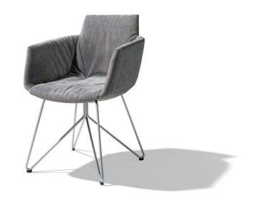
the new dining chair: grand lui with

The seating furniture in the <code>lui</code> family is based on a solid, ergonomic moulded wood shell. Together with a custom-made polyurethane foam coating, covered in elegant leather or fabric, this lets the chair nestle perfectly around the body. The characteristic folds of the <code>grand lui</code> and <code>lui</code> chairs suggest the flowing fabric of a haute-couture gown. But when you look the <code>lui</code> family in the face, you might also think of laugh lines or a wink. These gentle folds look casual, but are the result of considerable technical skill, combined with detailed hand finishing. The trick is in the hand-crafted indentations, a technique borrowed from traditional upholstery work. In the <code>grand lui</code>, the folds that begin in the seat shell are carried right through the armrests. The <code>grand lui</code> upholstered chair is truly a feel-good chair. Not just because it seems to smile or wink at you. The crumpled look and ergonomically perfected height of the armrests contribute to an optimal seating experience.