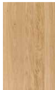
oak white oil