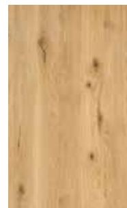
wild oak white oil*