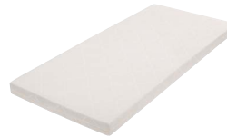
MA10 | MA15

formed by slats of elastic ash wood sprung 7-fold on natural latex strips in 2 planes