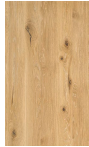
wild oak white oil*