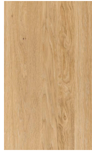
oak white oil